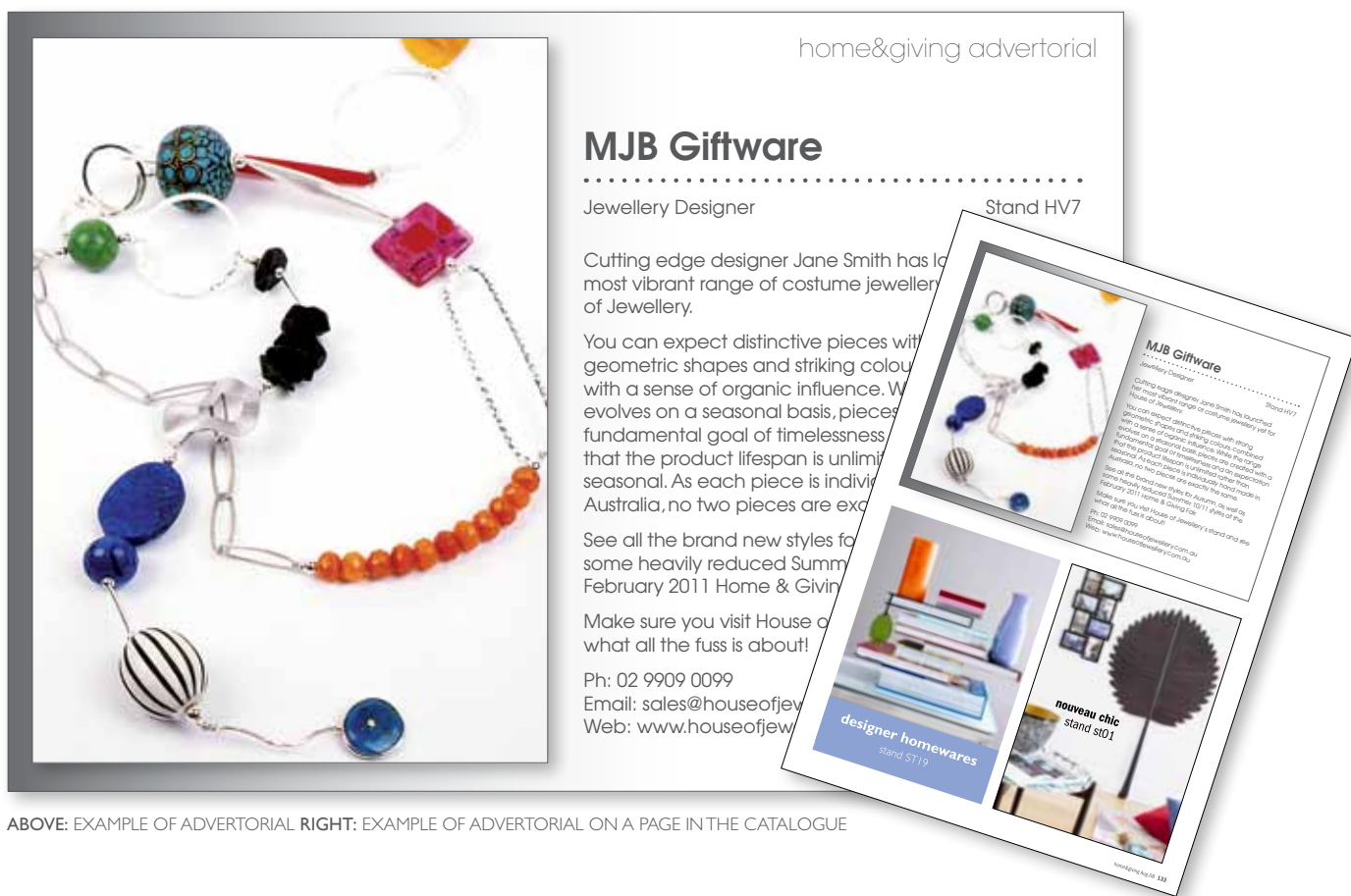
ABOVE: EXAMPLE OF ADVERTORIAL RIGHT: EXAMPLE OF ADVERTORIAL ON A PAGE IN THE CATALOGUE

Why not give your company the leverage it deserves? Stand out amongst the regular Home & Giving ads with a Home & Giving advertorial.